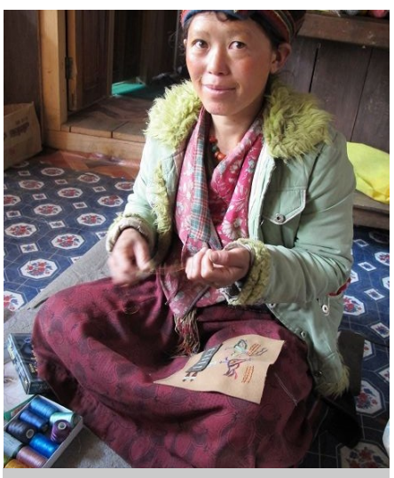
A Tamang woman embroiders images of household activities.

One of our new projects, Working with Earthquake-Affected Weavers in Rasuwa: Exploring Tamang Livelihood and Education Opportunities, focuses on a marginalized Tamang community in Gatlang Village in Rasuwa, a district north of the Kathmandu Valley. Located west of the Bhotekosi River and reached after a two-hour drive along a dirt turn-off, Gatlang is the first stop on the Tamang Heritage Trail. It is known for its tight-knit web of houses featuring carved wooden facades and roofs laid with wooden shingles. Structures built up over years – homes, the secondary school, the cultural center where people gathered, guest houses and home stays – were destroyed in the earthquake. Over five hundred households have been displaced; people are now living in scattered tents on the outskirts of the village.