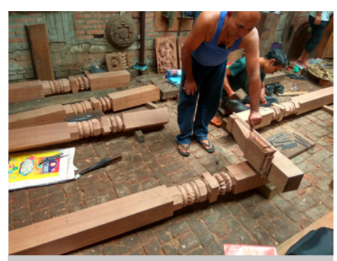
Pillars for the traditional pavilion are carved by craftsmen from Bhaktapur.