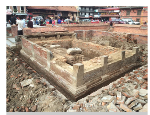
Assessment of the Manimandapa Temple at Patan Durbar Square.