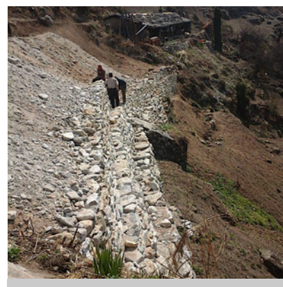
Stones support the mountain slope where the new classrooms will be.

Committed to fostering children's education, SAI Help Nepal supported the restoration of another Public School in Dolakha District . Kalidevi Primary School in Mirgetar has 150 students enrolled from kindergarten to grade eight. The earthquake caused at least partial damage to all blocks, and one block collapsed completely. The students first resumed classes in tents while temporary classrooms were being built with bamboo strips. Even though the school management tried hard to conduct classes, the poor condition of such structures impeded regular education. Given the remoteness of the area, no efforts were made by the government to adequately rebuild the school. After an assessment by local partners on the ground, SAI Help Nepal decided to support the construction of two classrooms, with further help from the school administration. A team of volunteers worked in cooperation with the school authorities to complete the project.