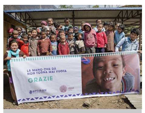
Children of Shree Jharlang Primary School posing for a photo after the reconstruction.

Committed to fostering children's education, SAI Help Nepal supported the restoration of another Public School in Dolakha District . Kalidevi Primary School in Mirgetar has 150 students enrolled from kindergarten to grade eight. The earthquake caused at least partial damage to all blocks, and one block collapsed completely. The students first resumed classes in tents while temporary classrooms were being built with bamboo strips. Even though the school management tried hard to conduct classes, the poor condition of such structures impeded regular education. Given the remoteness of the area, no efforts were made by the government to adequately rebuild the school. After an assessment by local partners on the ground, SAI Help Nepal decided to support the construction of two classrooms, with further help from the school administration. A team of volunteers worked in cooperation with the school authorities to complete the project.