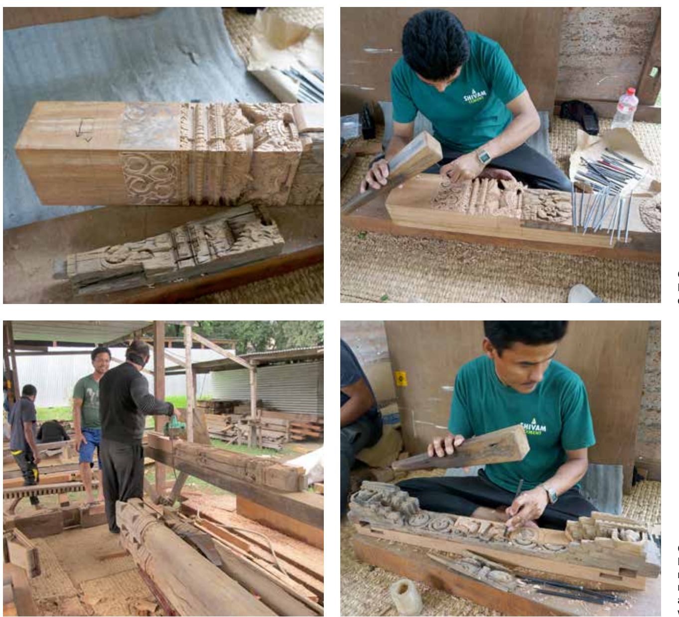
Char Narayan Temple | May 30 & June 01, 2016 Door jamb ( mubaha ) after addition of new timber and during carving replication.