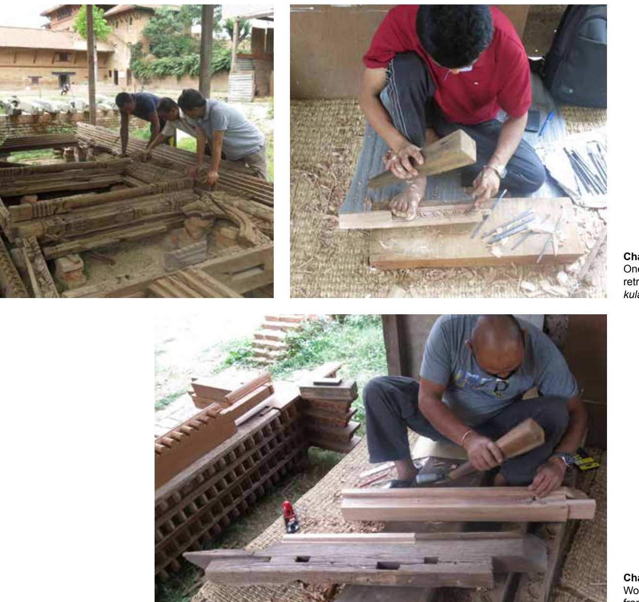
Char Narayan Temple | May 05, 2016 One of facade door is being inspected for repair and retrofitting work. Woodcarver replicating the missing kulah (cornice) of the door.