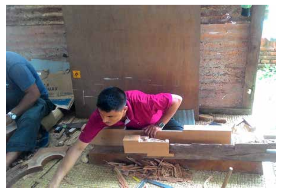
Char Narayan Temple | June 21, 2016 Woodcarver adding details of existing door parts to the new timber piece.

Char Narayan Temple | June 19, 2016 A view of workshop at Bhandarkhal Garden where woodcarvers and carpenters are repairing and replicating the damaged and missing parts of the doors.