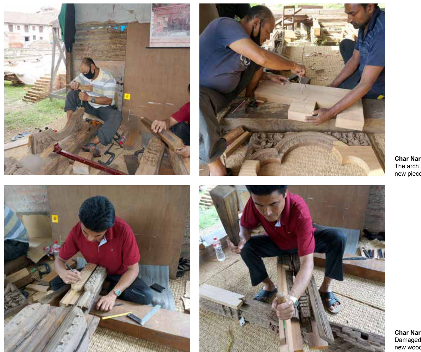
Char Narayan Temple | June 05 & 08, 2016 The arch of the main door is being repaired by adding new piece of wood for replicating carving details.