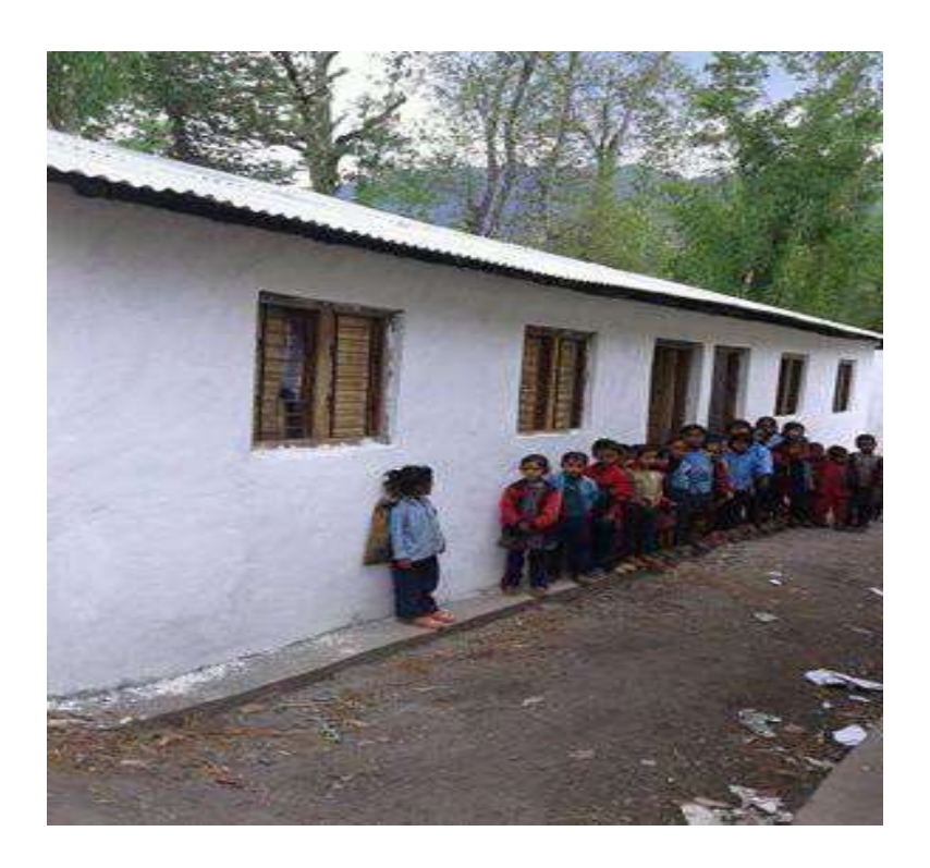
Students ready to enter their new classrooms