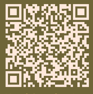
More information about papers and venues