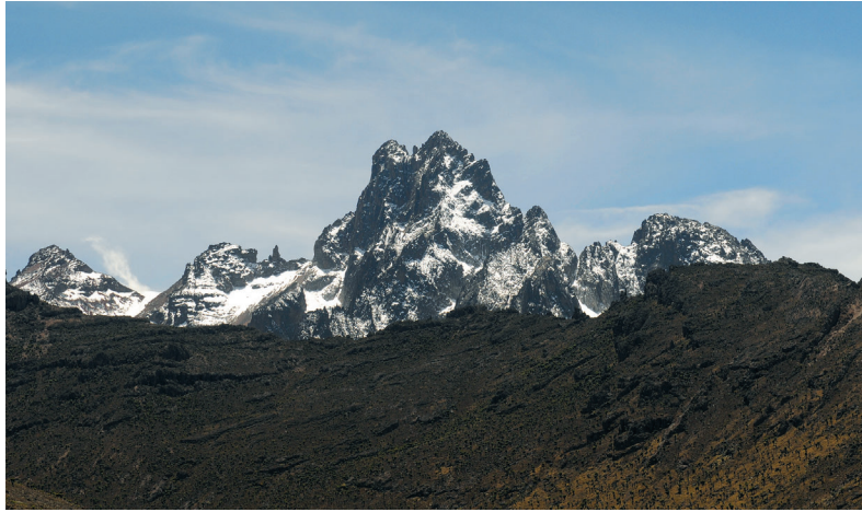
Photo 2: The north face of Mount Kenya with the twin peaks Nelion and Batian, 9 February 2009

glaciers on Kilimanjaro and Mount Kenya that arose following their initial exploration ( Krapf 1858, Meyer 1888, Honold 2000) finds itself mirrored in the present day with these glaciers having taken on the role of global climate change indicators ( Thompson et al. 2002, Kaser et al. 2004). The emblematic nature of these massifs is nothing new and is closely intertwined with their role as geographical centre pieces in the colonial expansion of Great Britain and Germany in East Africa.