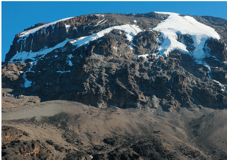
Photo 4b: The summit of Kibo from the south (4,250 m), 31 December 2008