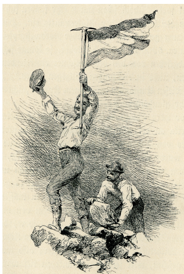
Figure 2: Meyer and Purtscheller at the summit of Kilimanjaro