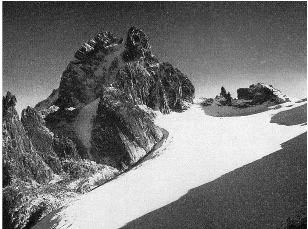
Photo 5a: Upper part of the Lewis Glacier with twin peaks of Nelion (right) and Batian (left); May 1934