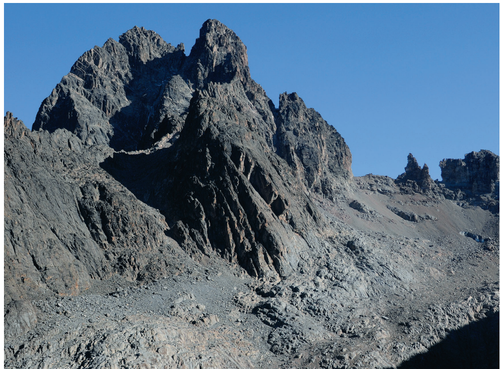
Photo 5b: Upper part of the Lewis Glacier with twin peaks of Nelion (right) and Batian (left); 11 February 2009

mation (Mölg et al. 2008, p. 177). Based on climate modeling the plateau glacier atop Kibo will disappear by the mid-21st century (Kaser et al. 2004, p. 337). Even if the general trend of glacier retreat on Kilimanjaro remains undisput-